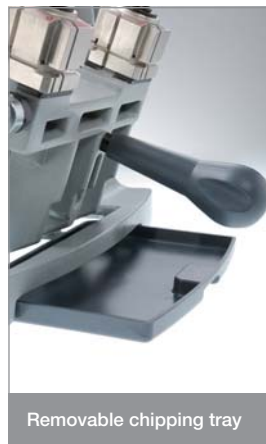
Removable chipping tray