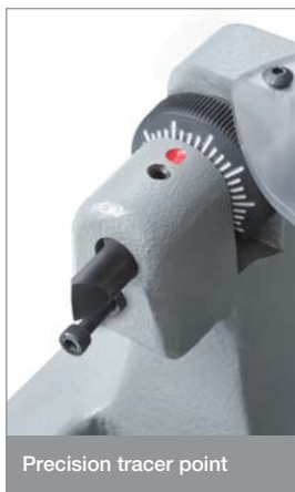
Precision tracer point