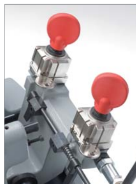
Four-face rotating clamps

Speed is engineered in conformity with CE mark European standards.