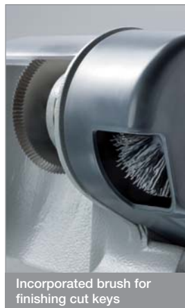
Incorporated brush for finishing cut keys