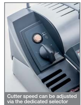
Cutter speed can be adjusted via the dedicated selector

The on-off switch features a safety cut-out for user protection. The carriage cannot be released until the gauges have been disengaged for avoiding accidental damage.