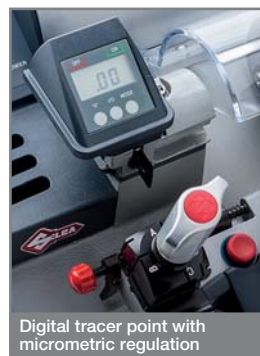
Digital tracer point with micrometric regulation

The four-sided clamps accommodate a wide variety of keys and feature an easy-to-rotate system for a quick tool adjustment. The patented dynamometric clamping system with controlled movement knobs ensure perfect key locking. The grip is balanced and secure to avoid damage to the key and to the clamp due to wrong or excessive pressure.