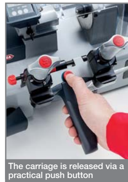
The carriage is released via a practical push button

The machine is equipped with a digital tracer point with micrometric adjustment ring nut (+/- 0,01 mm) for accurate cutting results.