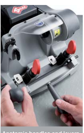
Anatomic handles and levers

The revolving, 3-sided clamps make it easy to block a broad variety of keys without the need of optional accessories: bit, double bit, pump, central stop, mail box and special keys, such as Abloy®, Abus®, Luma® and Ava Chubb® key types.